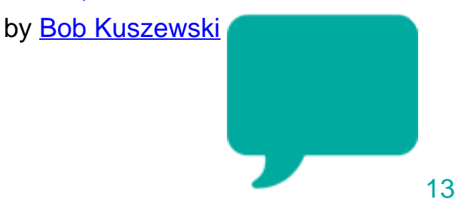
Connecting to Existing REST API without writing a Class

InterSystems announces General Availability of InterSystems IRIS, IRIS for Health, & HealthShare Health Connect 2022.1