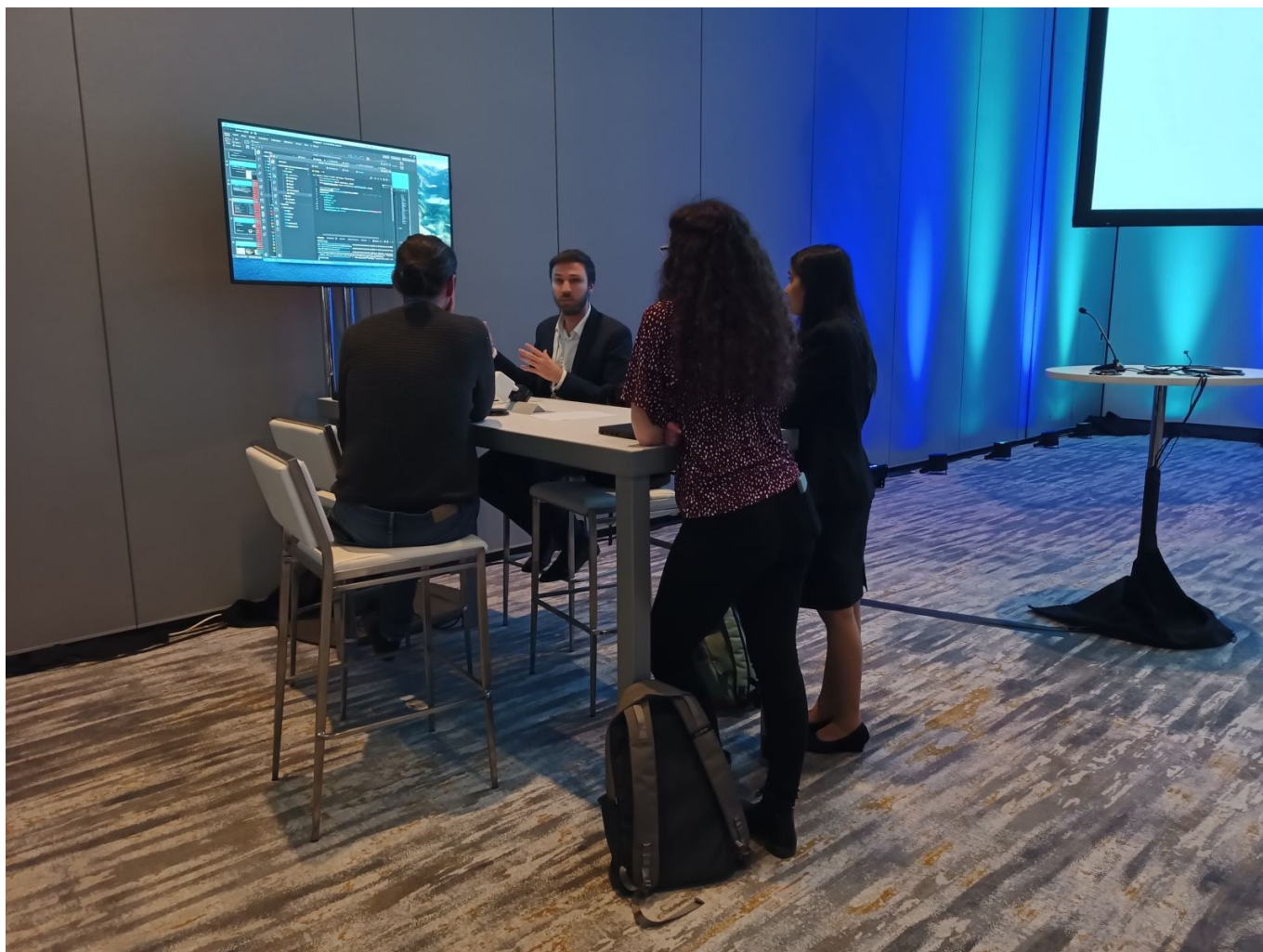
Employees, customers, and partners strolling around and discussing stuff.